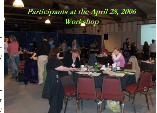
Participants at the April 28, 2006 Workshop